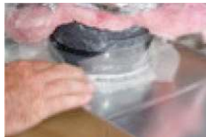
Install tie-strap and apply fiberglass mesh tape