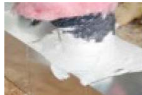
Apply mastic directly on the duct