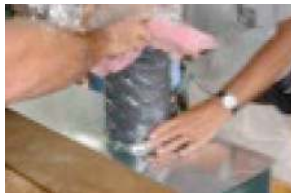
Pull back outside sleeve and duct insulation to expose flexible duct