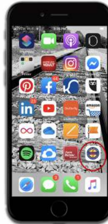
The DREMC mobile app will download to your device.