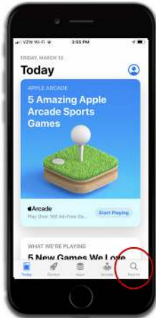
Click on the search button at the bottom of the screen.