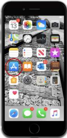
Click on the app store icon.

Before you download DREMC's mobile app, register your account first through our website using a desktop or laptop computer; go to dremc.com/my-account , select LOG IN and click on NEW USER. Use your DREMC account number and create a password. Fill in your information, including your mobile number. When you download our mobile app, DREMCmobile, you'll have quick and easy access!