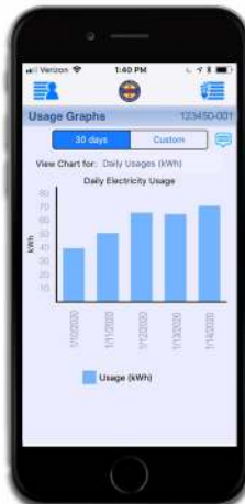
With your advanced meter, you can view daily electric use under the usage graphs, receive daily energy use alerts via text and/or email and set other alerts and reminders for your account, including outage alerts, billing due date reminders and more.