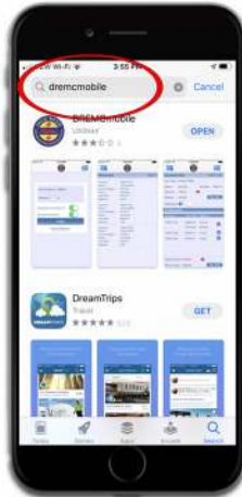
Type DREMCmobile in the search bar.